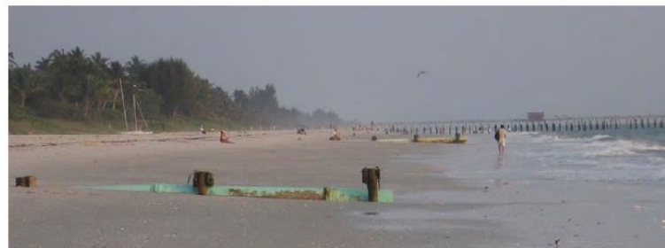
Figure 1-3. Typical Outfall Blockage (Outfall 9)